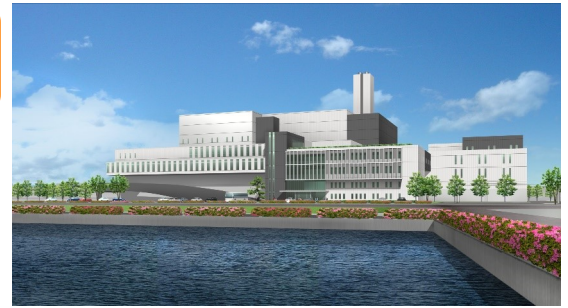
▲ Eco cleanpeer Harima

Since February 2022, burnable, non-burnable and oversized garbage in Kakogawa City have been processed at the Eco cleanpeer Harima (address: 6-1-1 Umei, Takasago City) operated by two cities and two towns (Kakogawa City, Takasago City, Inami-cho and Harima-cho). If you carry in your garbage by yourself, please bring it to the Eco cleanpeer Harima.